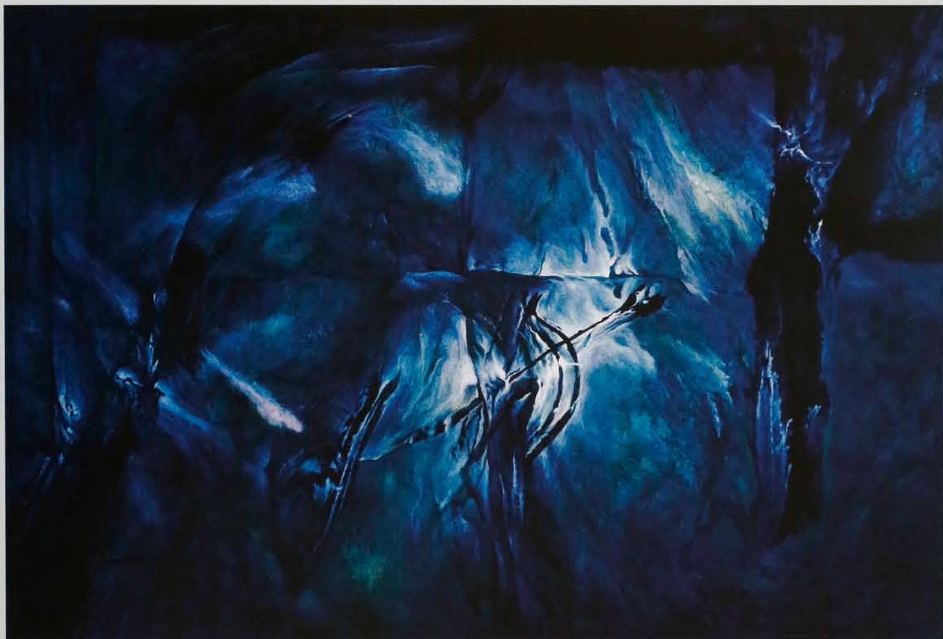
The Deep Fluoresce I 34"x50" Acrylic & mixed media on canvas

they are in the collections of Cantor Center for Visual Arts at Stanford University; Asian Art Museum of San Francisco; Minneapolis Institute of Arts, Macao Museum of Art and Guangdong Museum of Art. He has won 37 awards, including Best of Show, at the 42nd Annual Juried Exhibition by the Sumi-e Society of America, and Gold Medal Award at the XV Exposicao Colectiva dos Artistas de Macau in Macao.