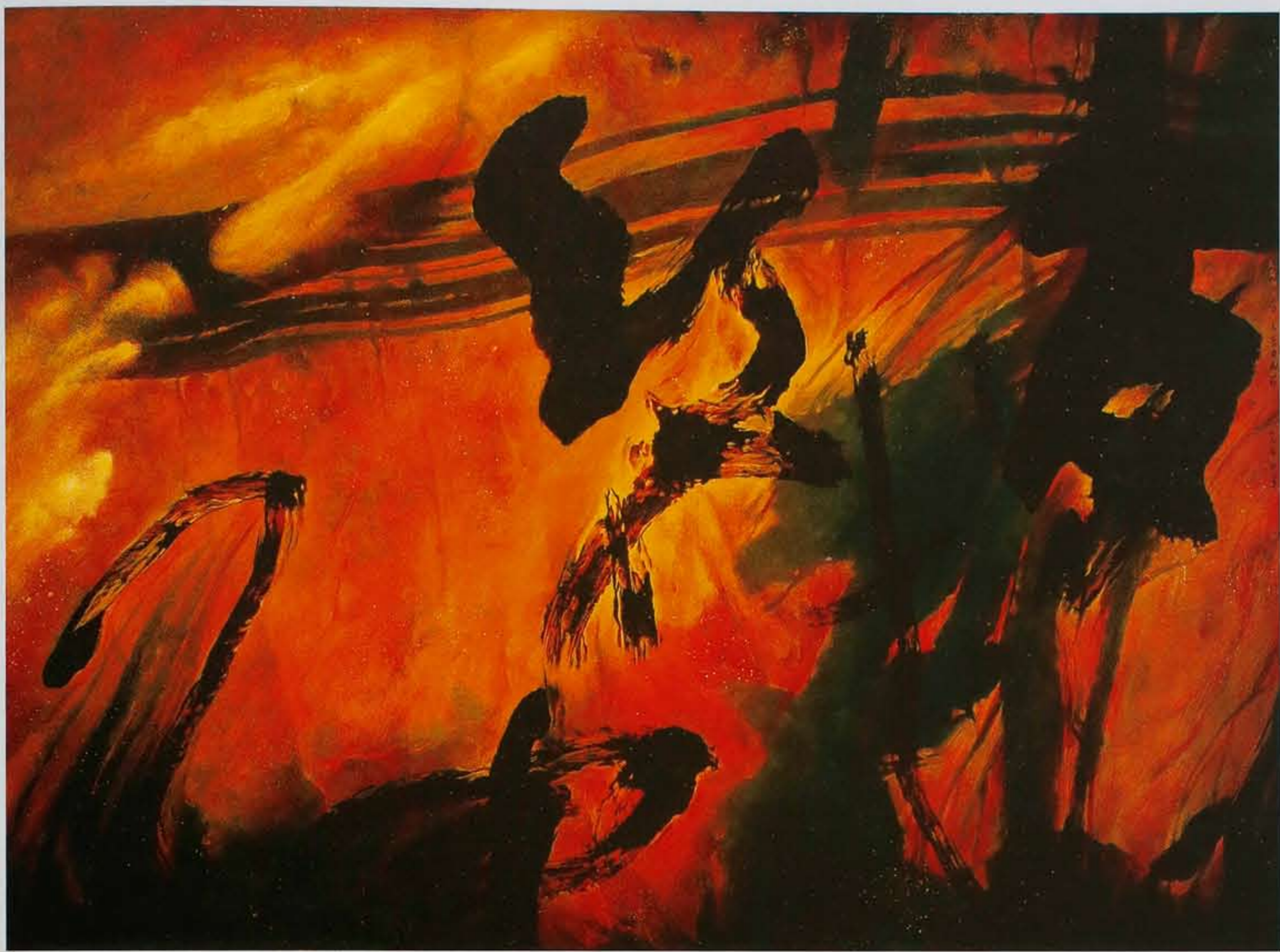
Solar Resonance I 34"x46" Acrylic & mixed media on canvas