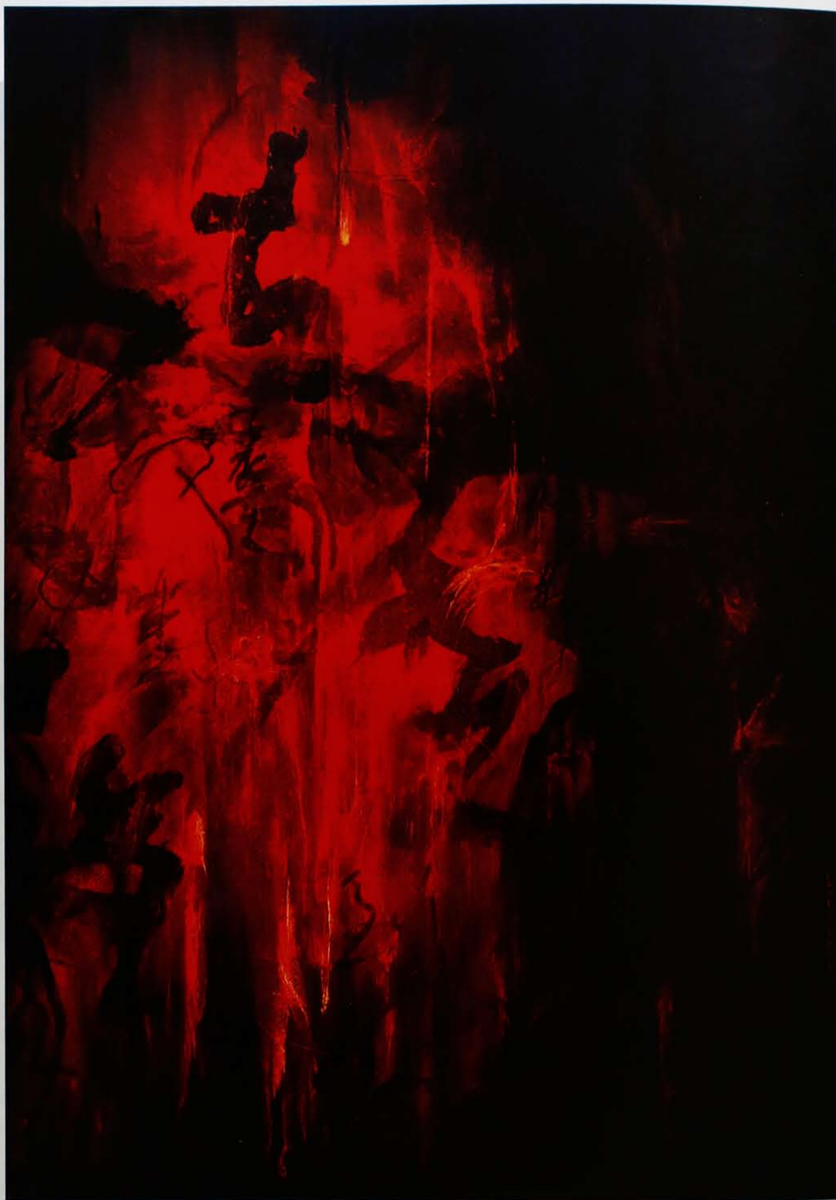
Motivic Consistency I 65" x 46" Acrylic & mixed media on canvas